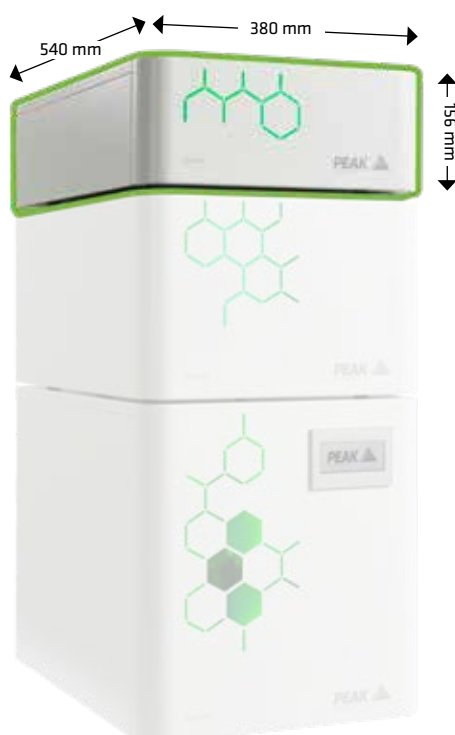
Zero Air 1.5L/3L unit size pictured in a typical Precision stack.